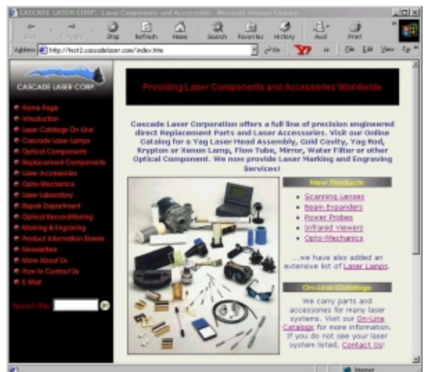
Cascade Laser's New Website

you may have would be greatly appreciated. You can e-mail your comments or concerns to webmaster@cascadelaser.com . Thank you for your support and we hope you enjoy the new site.