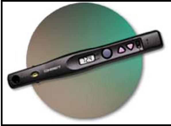
Figure 1: Coherent's LaserCheck Power Meter