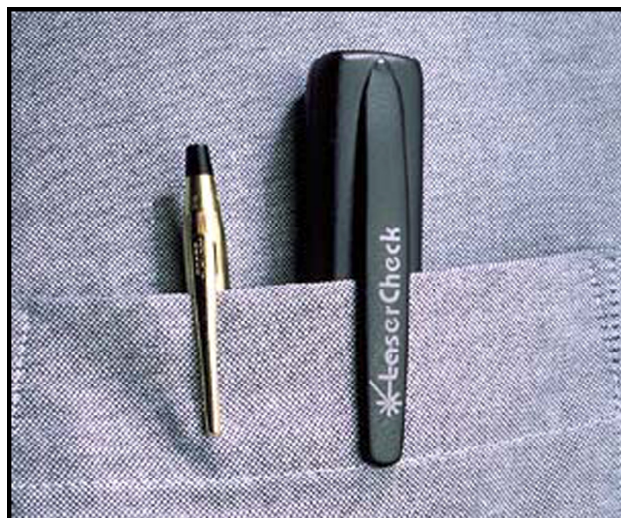
Figure 2: Coherent's LaserCheck Size Comparison