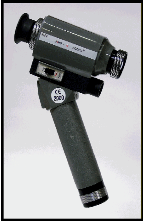
Figure 1: FIND-R-SCOPE with LED illumination